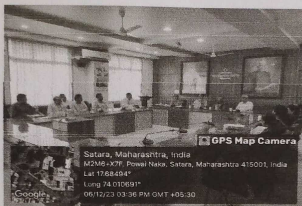
3. Discussion on the syllabus