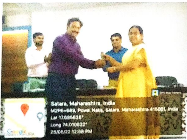
Welcome of Head of the Department