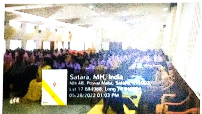
B.Sc.-III Year Students for Lecture